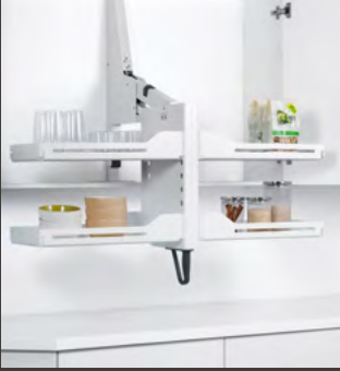
Libell shelves, white