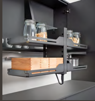
Libell shelves, anthracite